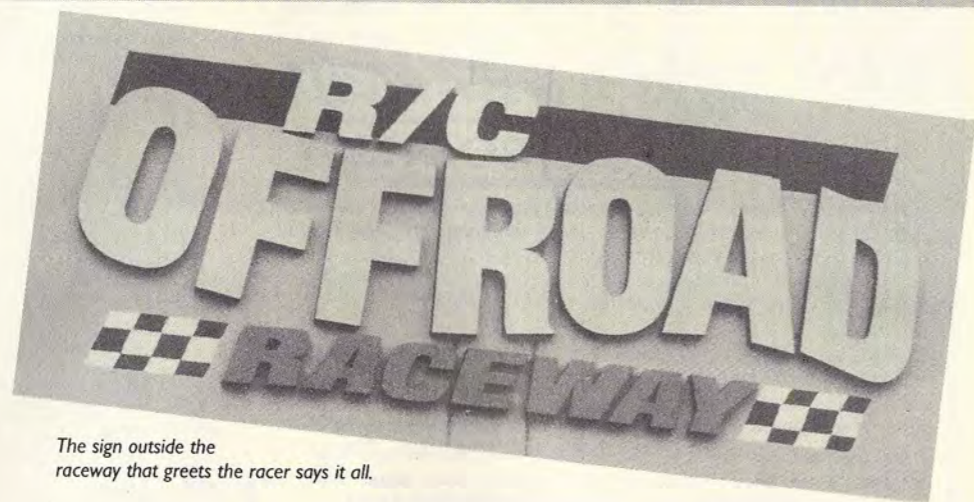
The sign outside the raceway that greets the racer says it all.