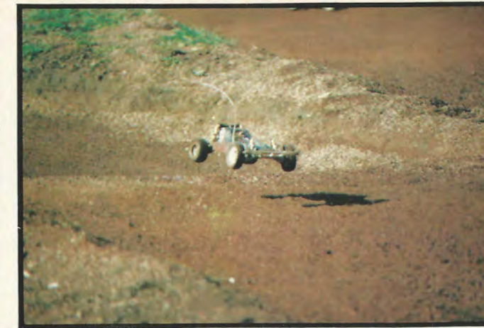
Two photographs of the very camera shy Associated 4WD prototype, in action she was very promising.

officials and the vibrating roller busy as they reworked any part of the surface that needed attention. Once more the weather followed the same format and by midday the track had begun to dry out, a freshening wind had all traces of moisture gone by early afternoon. By this time it was becoming obvious that fifteen laps were needed by anyone wishing to make the A final, in fact the first twenty six places were all given to drivers with fifteen laps any less and you got no more than a D final place, that's how hot the competition was. By this time Gil Losi had begun to show the form that made him World Champion driving in superb fashion to finally clinch position ten and a place in the A final. Rory Cull was flying round, his P.B. was handling superbly as he battled through to sixth place. The race of the day however came in round three, a lone battle between the two Cats of