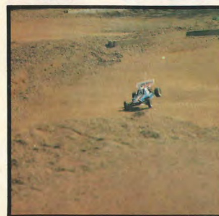
The Romsey circuit was a testing, incredibly slippery surface that brought the best out of the drivers.